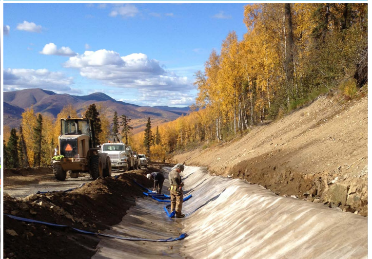
CC post hydration