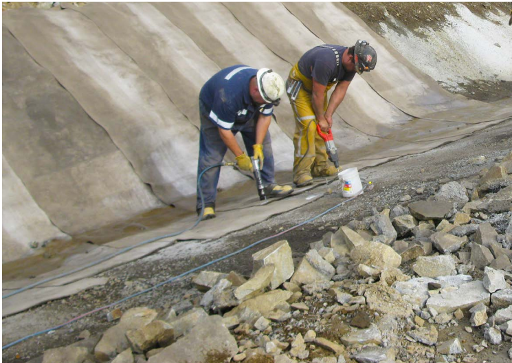
Fixing the CC to the existing shotcrete