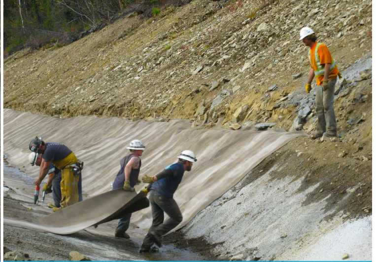
Unrolling the CC5™