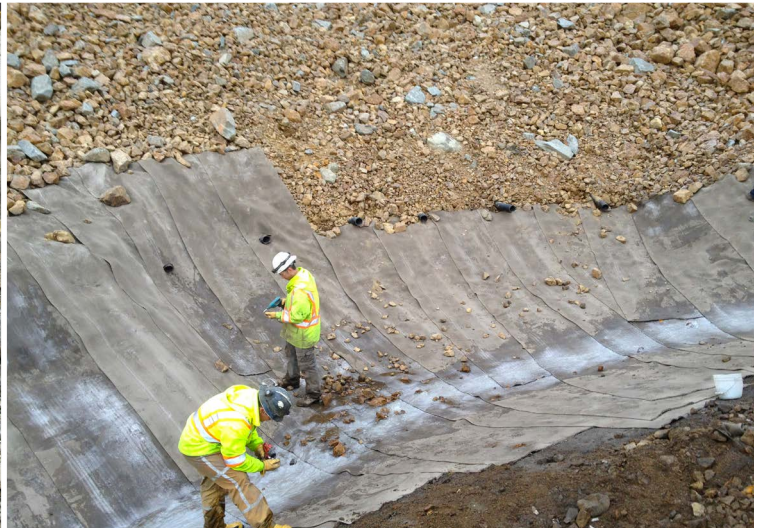
Joining the CC overlaps