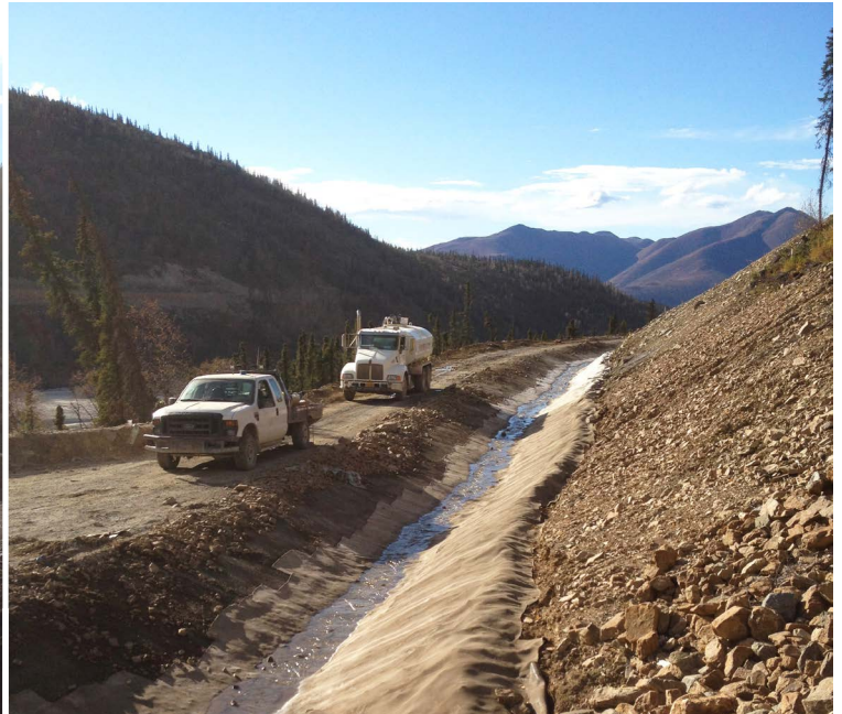
A section of the completed ditch