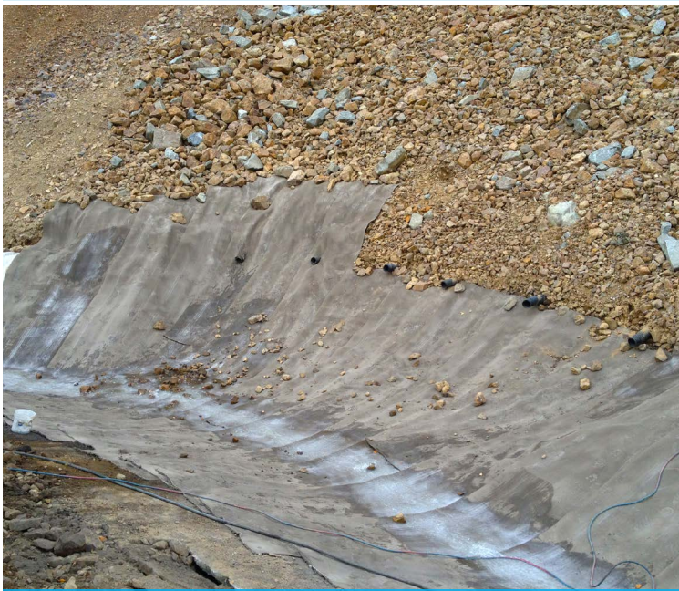
Corner and infrastructure accommodation