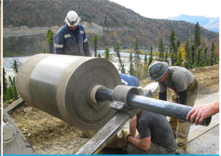
CC mounted to Caterpillar small wheel loader