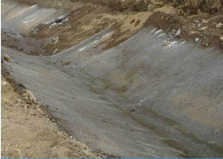
Existing shotcrete ditch