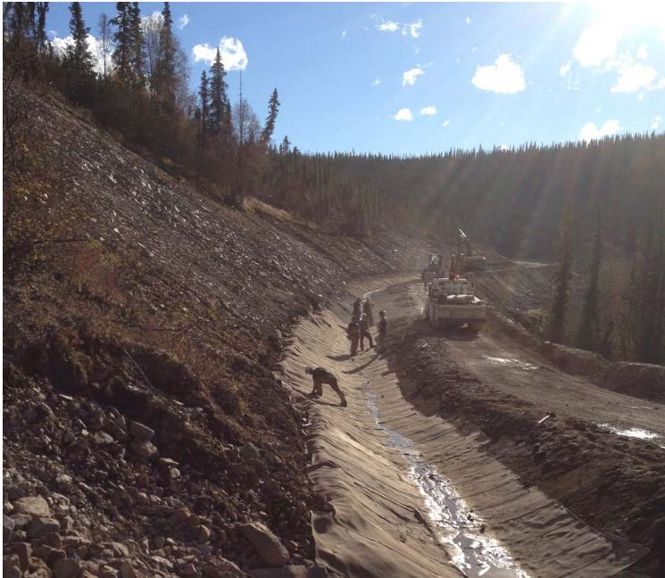
A section of the completed ditch