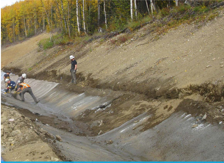
Slope causing the runoff undermining the shotcrete ditch