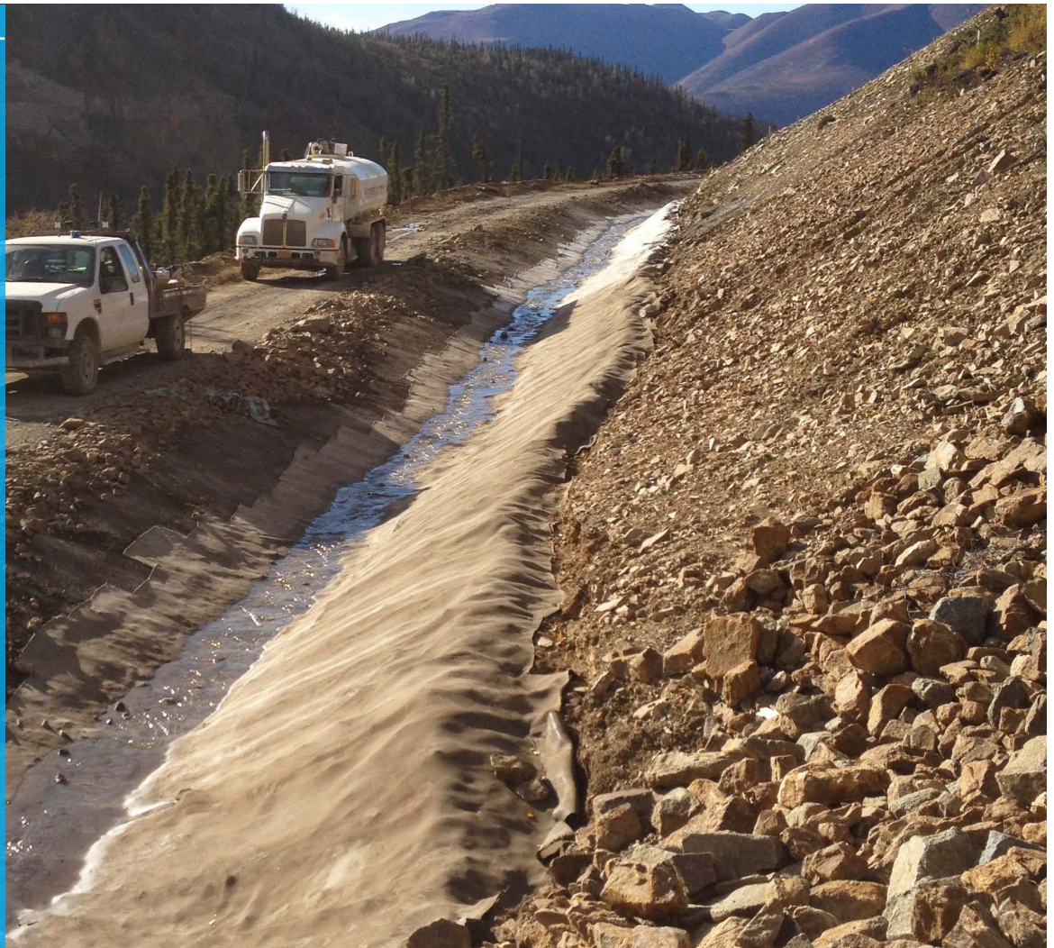
Completed section of ditch

CC5™ and CC8™ used to remediate a dilapidated shotcrete drainage ditch