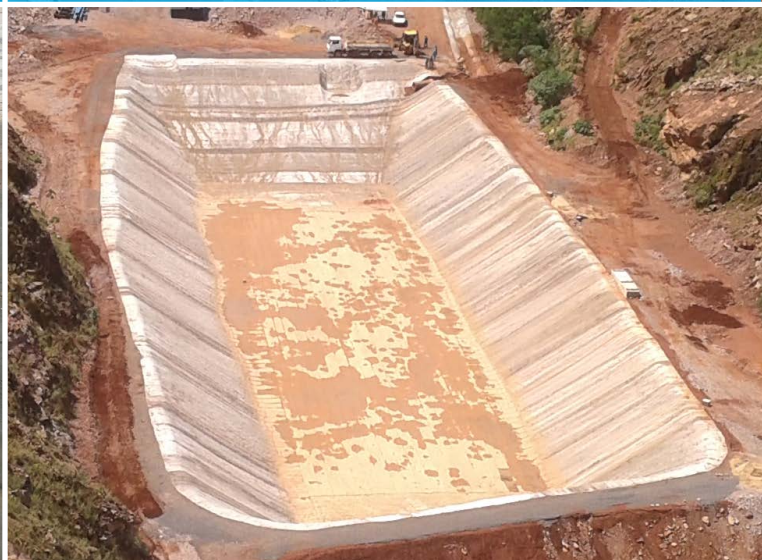
The completed lagoon