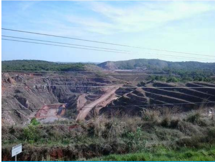
The mine site