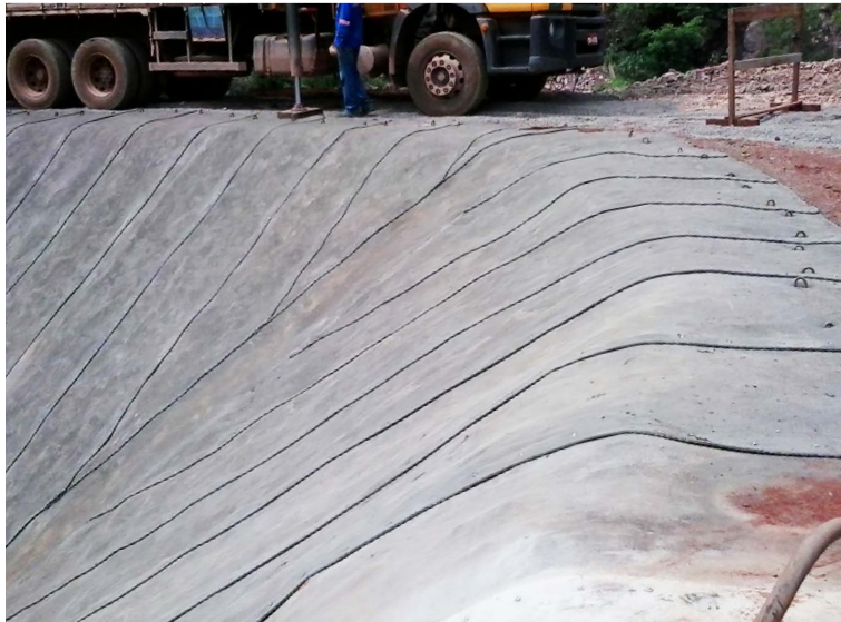
CC pegged at the crest